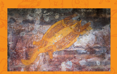
First Nation experiences