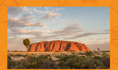
See the real Australia