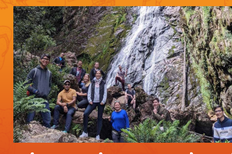
Advanced eco-certified lince 2002