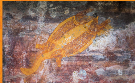
First Nation experiences