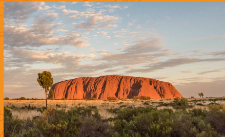
See the real Australia