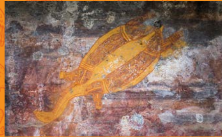
First Nation experiences