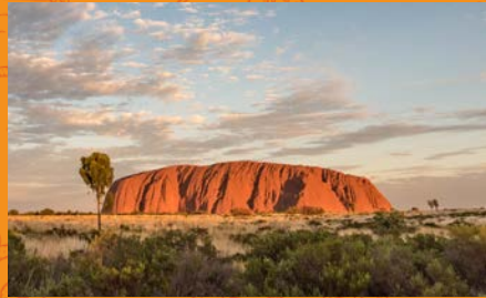
See the real Australia